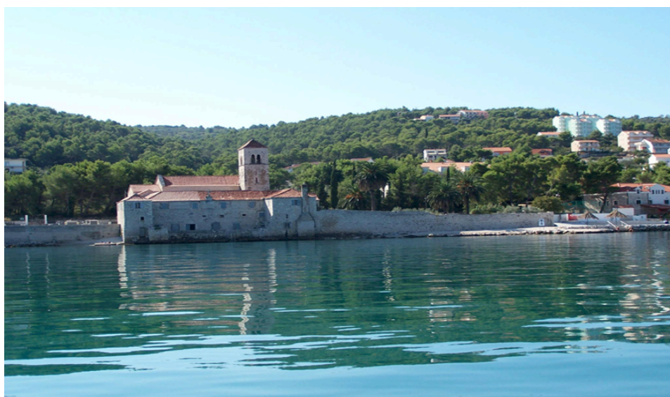
THE CHURCH OF THE SAINT CROSS

Hotel Sveti Križ is only 30 m from the beach, surrounded by pine forests, in the vicinity of the Church of the Saint Cross 2.5 km from the centre of Trogir.