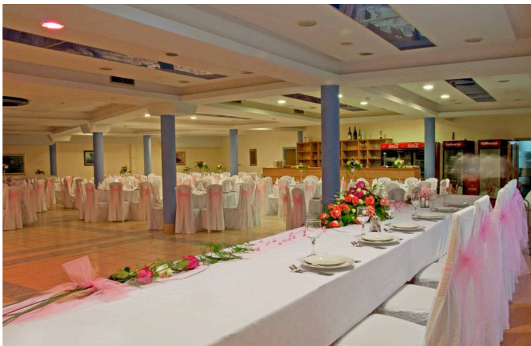
MAIN CONFERENCE HALL FOR UP TO 120 PEOPLE

The Hotel Sveti Križ has 3 conference rooms (4 if required) and there is a spa centre with diverse treatments, which have to be booked at an additional charge. Access to the gym and outdoor pool is free.