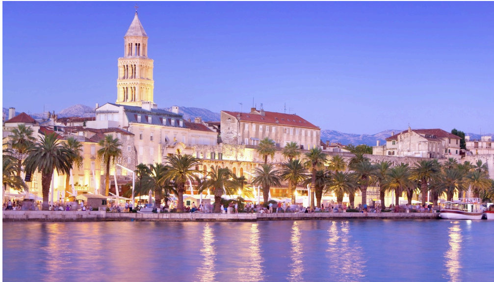
CITY OF SPLIT

Hotel Sveti Kriz Hotel is surrounded by old Dalmatian historical cities like Split with its palace Dioklecijanovom, Solin with an old saloon, Omis, Klis from their fortresses which defended Split from the Turks. But there are also worth mentioning the islands of Brac, Hvar and Vis.